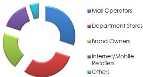
By Business Nature